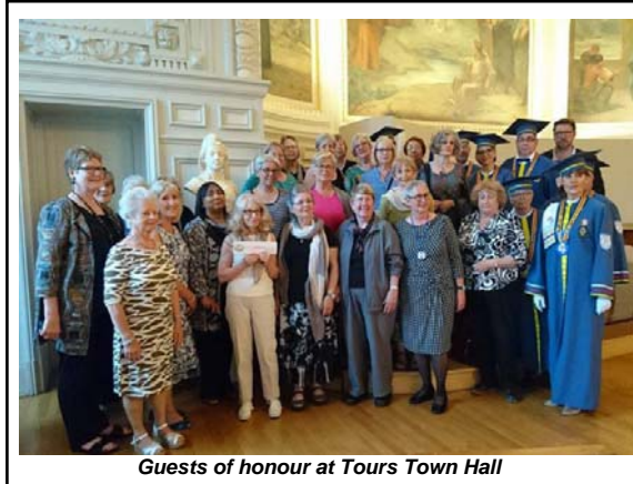
Guests of honour at Tours Town Hall