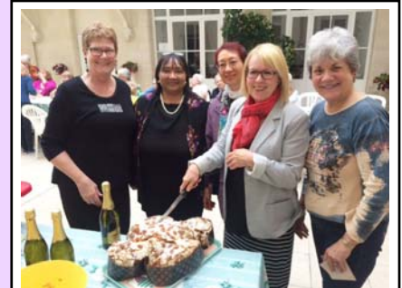
Cutting the 'dove of peace' cake on our first night at the convent