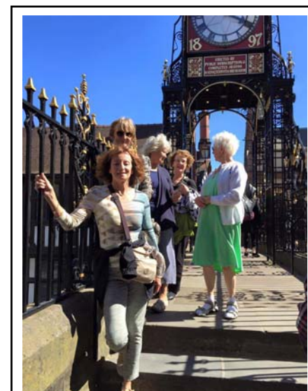
Chester on the Walls with Chester Clock in background

Chester Roman walls, cobbled streets and the river Dee running through the town. The Rows are a mediaeval shopping mall made up of small shops on two levels with the covered galleries of the upper level, accessed by steps from the street.